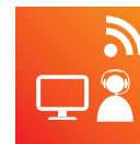
Communication & Management