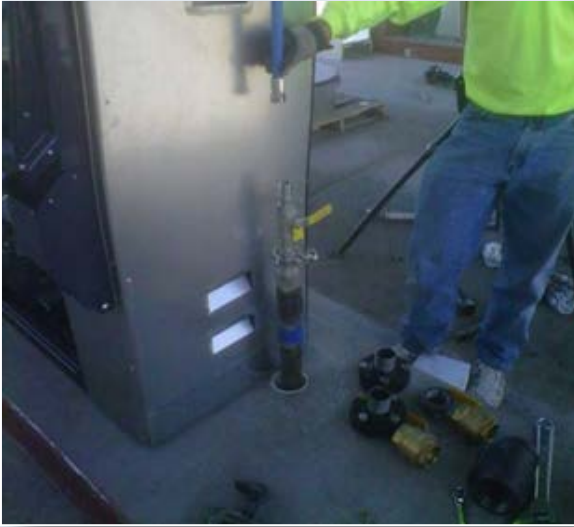
Above Ground piping to Dispenser