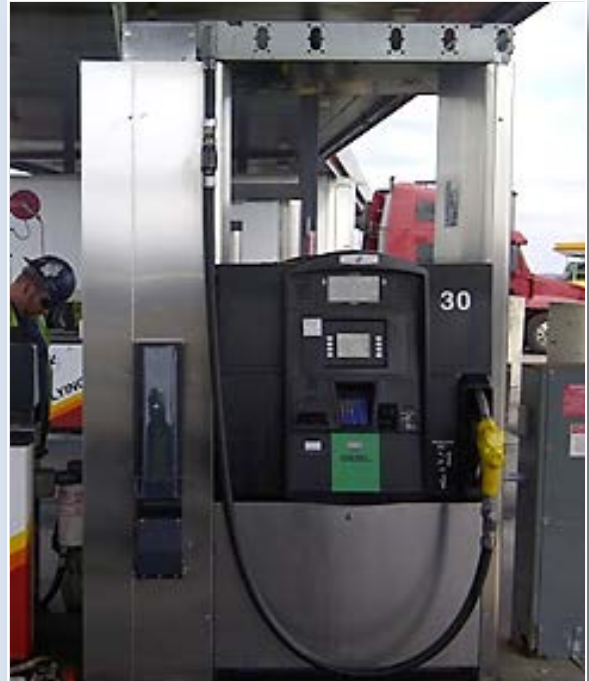
Retrofit kit to existing dispenser