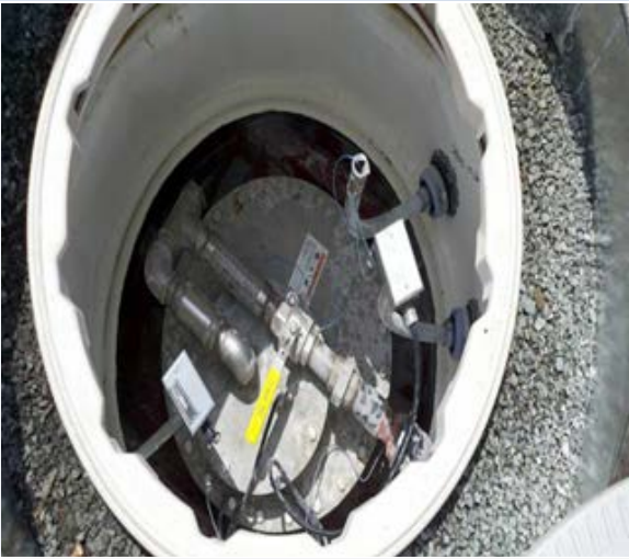
Below ground submersible