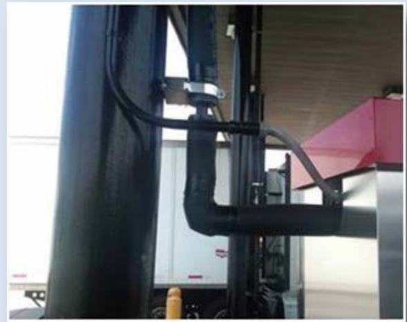
Below ground piping to dispenser