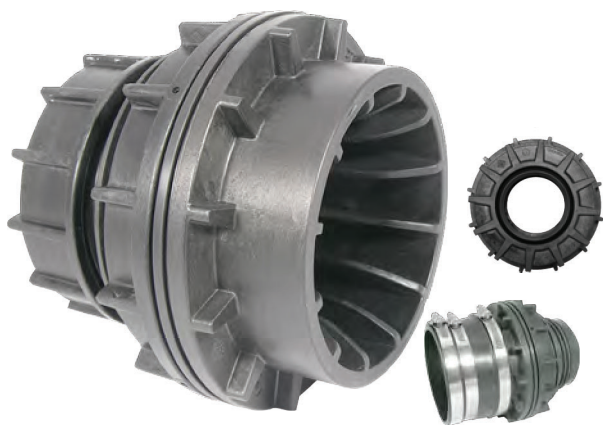
Ducted Entry Boot