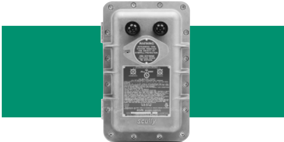
Model ST-15-ELK shown

Featuring Dynacheck® Automatic and Continuous Self-Checking Circuitry